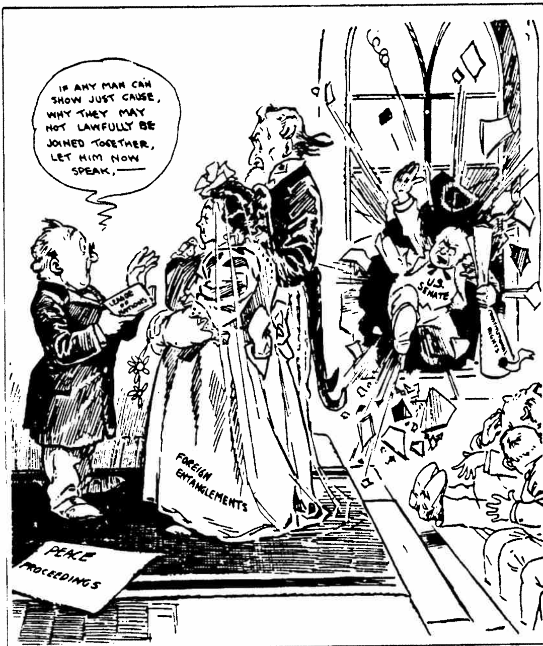
John T. McCutcheon. The Tribune (Chicago), 1918.